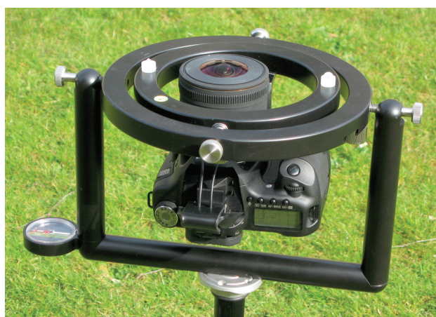
Digital SLR camera in the SLM8 Self-levelling Mount