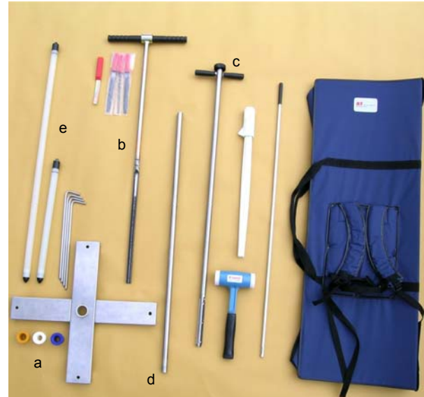
Complete Augering Kit, PR-AKC1. Shows (a) Stabilisation plate (b) Pilot auger (c) Finishing auger (d) Insertion rod (e) Short and long access tubes (not part of PR-AKC1)

PR-AKC1, Complete Augering Kit For installing both short and long access tubes in most soil types. Based on the PR-ASK1-L (long) kit, with the addition of a carrying bag, cleaning rod and flexicanes.