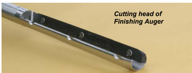
Cutting head of Finishing Auger

Finishing auger To expand augered pilot holes to the exact diameter required for an access tube, a new type of auger has been designed. This adjustable finishing auger produces straight, smooth-sided holes in most soil types (see image, left).