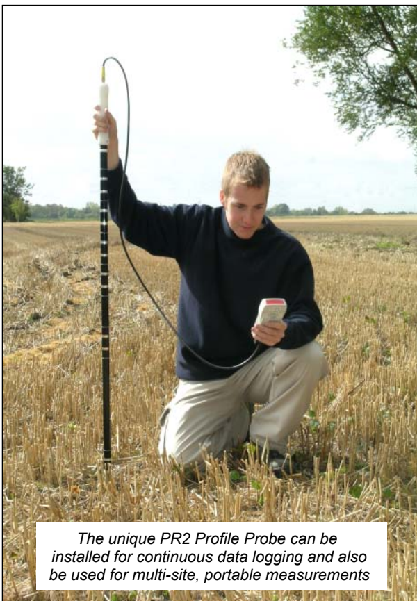
The unique PR2 Profile Probe can be installed for continuous data logging and also be used for multi-site, portable measurements

The PR2 Profile Probe uses newly patented 1 sensing technology making it possible to measure soil moisture content in a range of soil types and across a wide range of nutrient levels, including saline soil conditions.