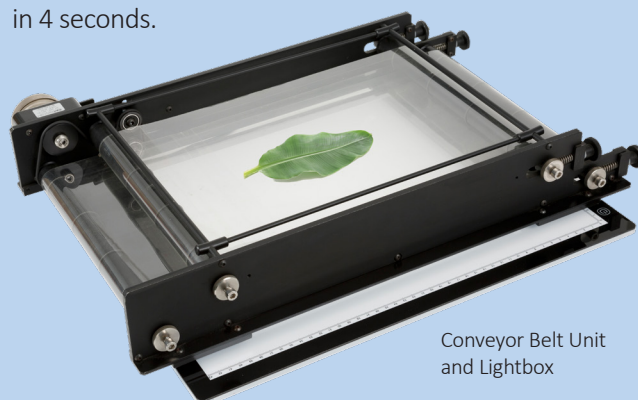
Conveyor Belt Unit and Lightbox

Long leaves: With the addition of the Conveyor Belt Unit, WinDIAS can measure leaves which are too long to fit in the field of view of the video camera. WinDIAS software repeatedly samples the leaf image as it moves past the camera at constant speed. Stored data sets include total area and the percentages of healthy and diseased leaf area. Typically, a leaf 30 cm long by 2 cm wide can be measured in 4 seconds.