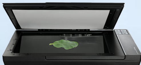
Entry Level System - Flatbed Scanner

Hardware: Users of Standard WinDIAS Systems supplied after March 2019 can upgrade to the Rapid System simply by ordering a Conveyor Belt Unit (subject to voltage type). Users of older WinDIAS systems wishing to update the lighting or add a Conveyor Belt Unit should contact Delta-T for guidance software.