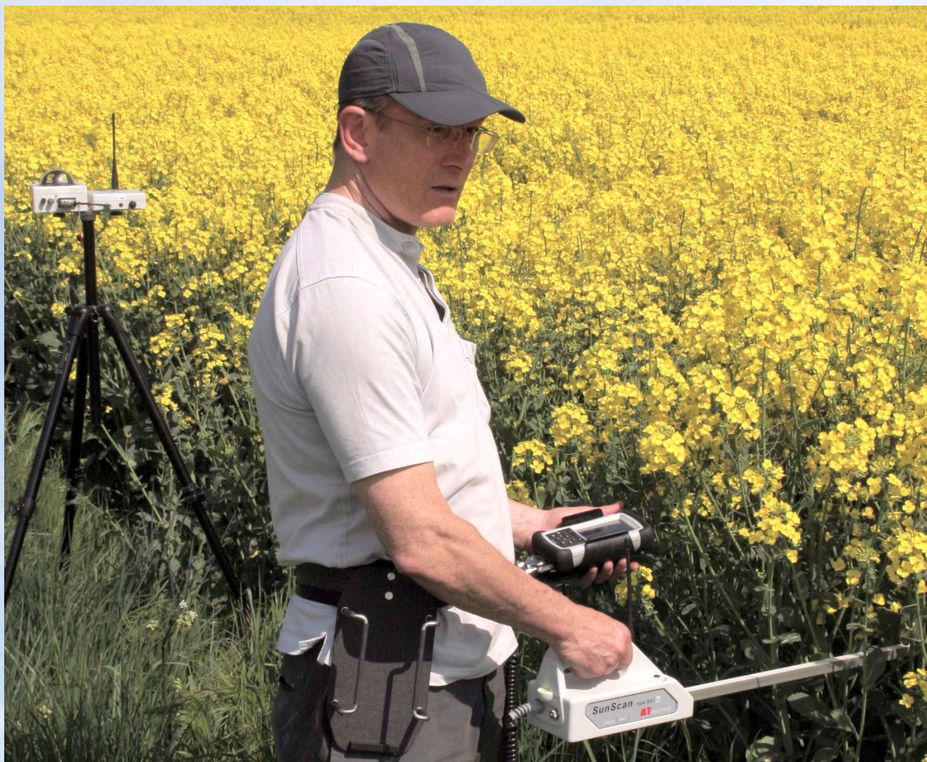
SunScan Probe (radio version) and PDA, with radio-linked BF5 Sunshine Sensor mounted on tripod