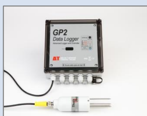
GP2 with ML3 ThetaProbe