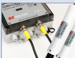
GP2 with PR2 Sensors

The GP2 is a research grade data logger, designed and manufactured to be rugged, sealed & completely dependable. Its program editor has built-in error checking, and enables the full logger configuration (including advanced features) to be road-tested before activation. Sensor integrity, set-up and connections can also be checked before or during logging by viewing real-time measurements. Fault tolerance is provided by intelligent statistics (rejecting erroneous sensor measurements), and safety conditions (upper and lower limits on active and rest periods). The relay outputs can be configured as intelligent alarm outputs, and LEDs on the front panel provide a quick visual reassurance that logging is proceeding ok.