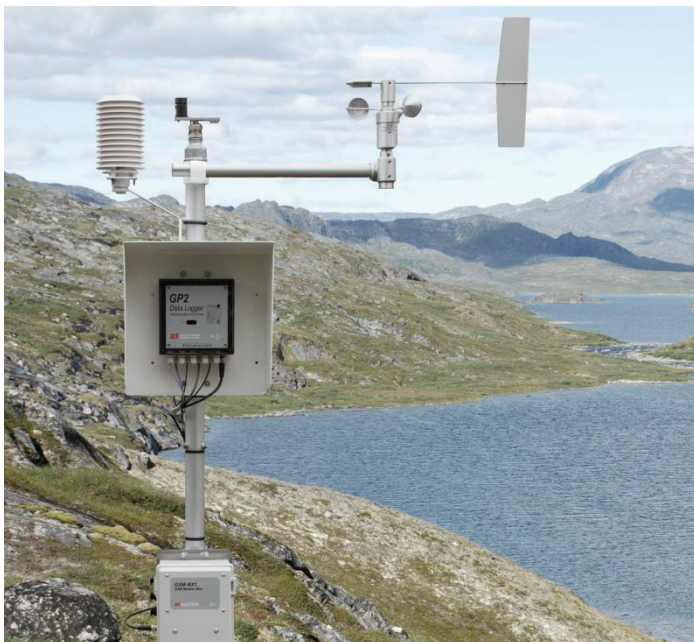
WS-GP2 Weather Station with optional modem box